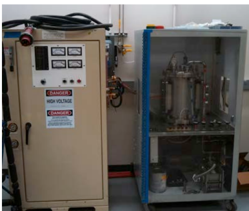
Figure 2. CFEET

Two potential NCPS fuels are currently under consideration - coated graphite composite fuel and tungsten cermet fuel. During 2014 a representative, partial length (~16") coated graphite composite fuel element with prototypic depleted uranium loading is being fabricated at Oak Ridge National Laboratory (ORNL). In addition, a representative, partial length (~16") cermet fuel element with prototypic depleted uranium loading is being fabricated at Marshall Space Flight Center (MSFC). During the development process small samples (~3" length) will be tested in the Compact Fuel Element Environmental Tester (CFEET) at high temperature (~2800 K) in a hydrogen environment to help ensure that basic fuel design and manufacturing process are adequate and have been performed correctly. Once designs and processes have been developed, longer fuel element segments will be fabricated and tested in the Nuclear Thermal Rocket Element Environmental Simulator (NTREE) at high temperature (~2800 K) and in flowing hydrogen. A picture of CFEET is shown in Figure 2, and a picture of NTREES is shown in Figure 3.